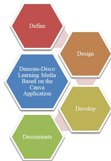
Figure 1. Flow of the stages of developing Demons-Disco media

Figure 1 shows the linear co-cost product development process: define, design, create, and deploy. This research will focus on the first three stages of product development, starting with definition (Riyadi et al., 2022). Prescribed actions include analyzing options and identifying problems. Condition-devaluating literature mining concepts and research findings from SINTA, Garuda, and Scopus are used for this task (Solehudin, 2023). A first inspection was done at the Bogor Agricultural Institute (IPB) research site. To gather profiles, data, and student academic assessments of