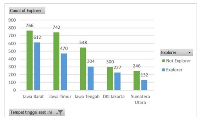
FIGURE 1. Personality explorer and program options

The number of participants who have a non-explorer personality and are not career-ready is more than the explorer personality and career-ready, and it can be seen that the top 3 positions are large provinces on the island of Java (West Java, East Java, and Central Java).